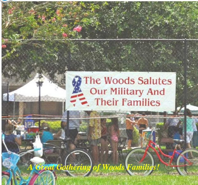
A Great Gathering of Woods Families!